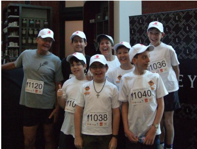
Enthusiastic wombats before the start of the climb.

On Sunday 4 th October clients and friends of Wombat Fitness participated in the 2009 Rotary Climb for a Smile. Our team, "Wonder Wombats" made its way up 50 flights of stairs to the top of the Bankwest Tower, raising almost $1,600 for several Rotary projects including WA Cord Blood Bank, End Polio Now and Interplast.